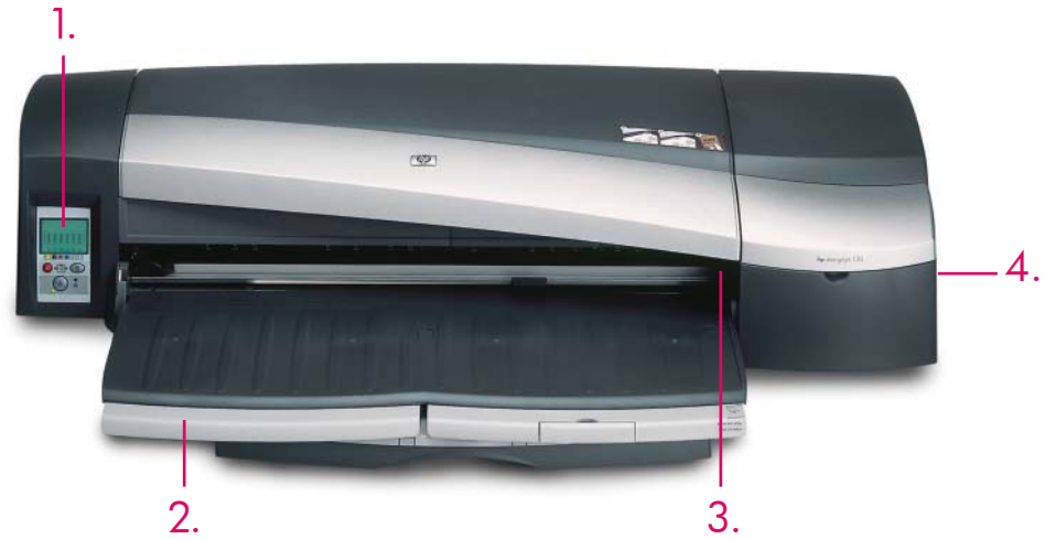
HP Designjet 130 front shown

Modular ink system with six independently replaceable ink cartridges allows you to replace only the ink colors you need