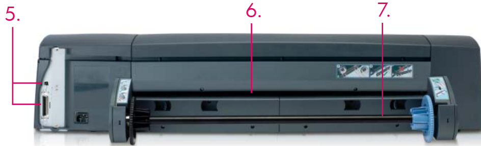
HP Designjet 130nr rear shown